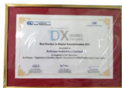
Hazira Manufacturing Division awarded for 'CII Digital Transformation (DX) Innovative Best Practice 2021' under Innovation in Supply chain and Logistics